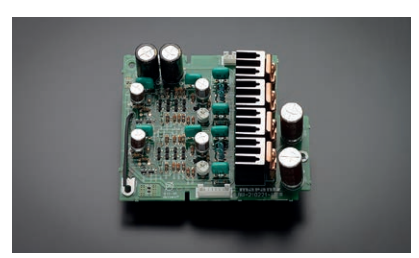
Fully discrete headphone amplifier