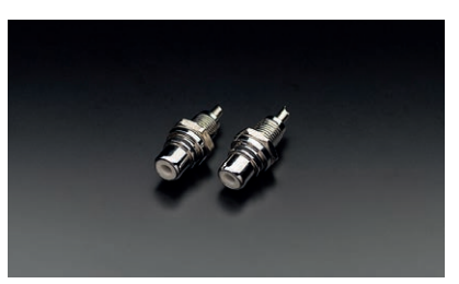
Thick nickle-plated copper output terminals