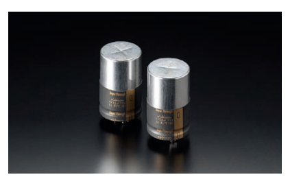
Custom-made Block Capacitors

For music lovers enjoying their favourite recording via headphones, the SA-10 features a high quality headphone stage with dedicated Marantz-own HDAM-SA2 amplifier modules. This unique circuit ensures a high Signal-to-Noise ratio, minimum interferences and an overall rich bandwith music playback. To work with a wide variety of headphones the gain factor can be changed from low to mid to high. It drives low to high impedance headphones effortlessly for the ultimate private listening experience.